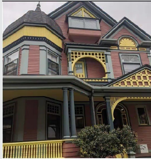
Figure 13: Painted Fibergutter on 12 Vernon St., Brookline, MA. This house built in 1890 is on the National Register of Historic Places (Ref. # 85003280).